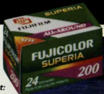
Above & right: New Superia 200 is a fine all-around film, well suited to sunlight, shade and electronic flash.