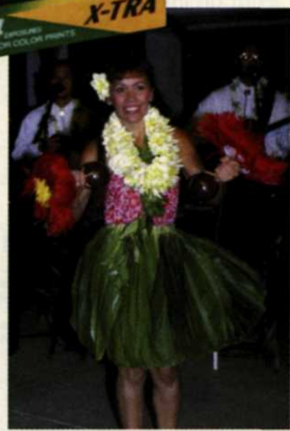
Below left & bottom left: Superia Reala is an improved version of Fuji's original Reala, famed for its sharpness and accurate colors under a wide variety of lighting, including fluorescents. This is a terrific people film, providing beautiful, realistic skin tones; and it's great any time color accuracy and image quality are paramount—e.g., when you want huge enlargements. The ISO 100 speed provides versatility.